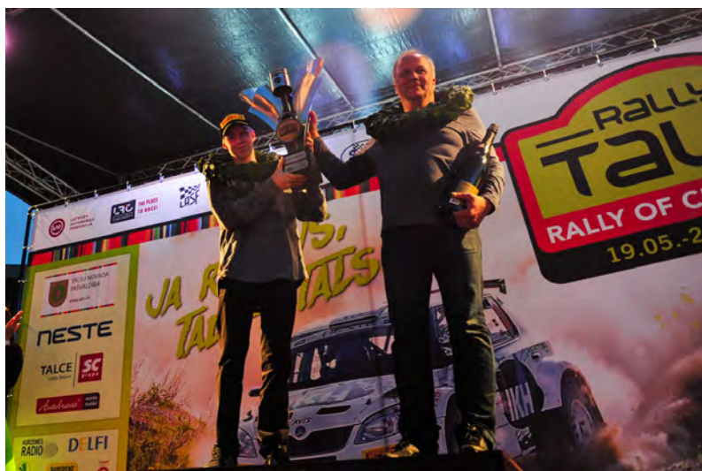
Champions' Challenge Cup winners 2017

For already tenth time, starting back in 2009 Rally Talsi bears a name of Rally of Champions and hosts a fierce competition for the Champions' Challenge Cup . The goal of the competition is to provide equal conditions for the AWD group champions of the previous rally season and sort it out, who is the fastest of them all. Rally of Champions has seen champions from the Baltics, Scandinavia, Belarus, Great Britain, Russia, Slovakia, and even Kuwait. Moreover, Rally of Champions has seen drivers, who made it to the very top and are now competing at the 2018 FIA World Rally Championship – Estonian Ott Tänak ( Toyota Gazoo Racing WRT ), as well as Norwegians Mads Østberg ( Citroën Total Abu Dhabi WRT ) and Andreas Mikkelsen ( Hyundai Shell Mobis World Rally Team ), accompanied by the uprising Finnish talent Kalle Rovannerä. Who will outcompete others to bring home the glory and for a year also Champions' Challenge Cup ?